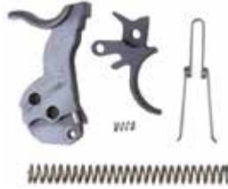
Bisley Kit shown

SPECS: Steel, polished blue or bright polished, natural finish. Hardened to Rc 56-58. Kits include 17 lb., 18 lb. and 19 lb. hammer springs, 30% reduced power trigger spring and extra power cylinder latch spring.